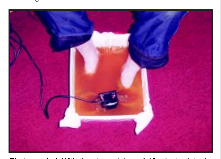
Photograph 4 . With the elapsed time of 18 minutes into the detoxification session, the footbath water is becoming murky and bubbles of mucus are concentrating around the array. Such mucus indicates that this man is giving up his accumulation of medication taken over time for symptoms of an allergy to dairy products.