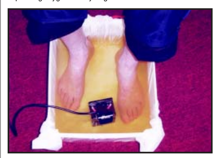
Photograph 2 . Here is the detoxifying footbath as it appears 6 minutes into the session. The water is beginning to turn yellow, showing that detoxification is occurring through the individual's kidney and bladder area.